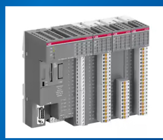
ABB PLC AC500 and S500 Safety ABB make HMI and VFD

The AC500-eCo is approved for customer use by accredited certification organizations around the world. This means the entire range can be deployed safely, reliably and globally.